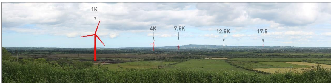
Figure 1-1 The effect of distance on visibility of wind turbines (Illustrative Purposes Only)